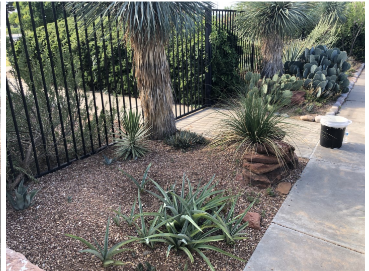
© Update to outdoor beds at WRG

COCSS membership dues are $10 per individual or $15 per household. ( form )