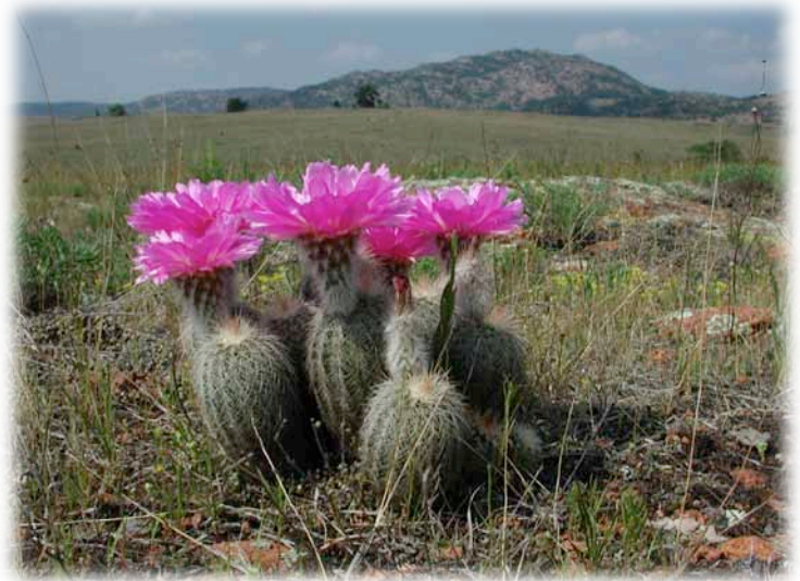
Echinocereus reichenbachii subsp baileyi in the Wichita Mountains NWR, Oklahoma. Mount Scott in the background.